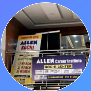
Educational & Institutional Banners