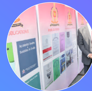
Gov. Body Banner