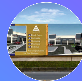
Real Estate Outdoor Banner