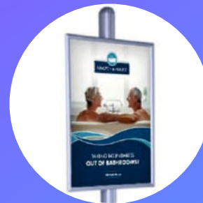
Display Information Banner