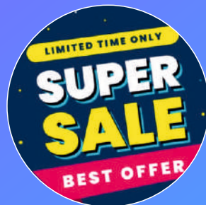
Event Promotion Banner