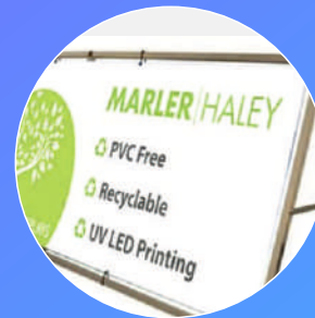
Outdoor Advertising Banner