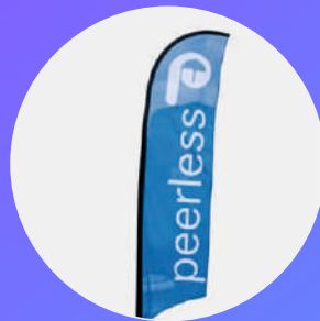
Promotional Activity Banner