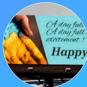
Billboard / Hoarding Adv. Banner