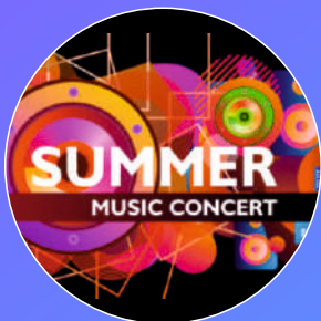
Music & Concert Banner