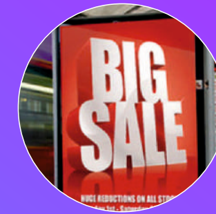
Sales Scheme Banner