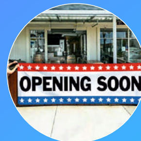
Opening Soon Outdoor Banner