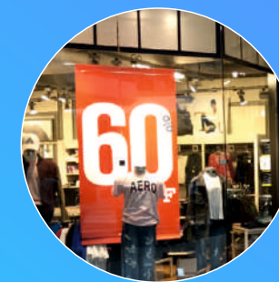
Retail Outlet Outdoor Banner