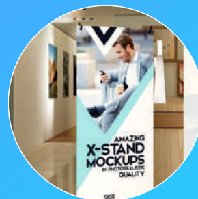
Indoor Adv. Banner