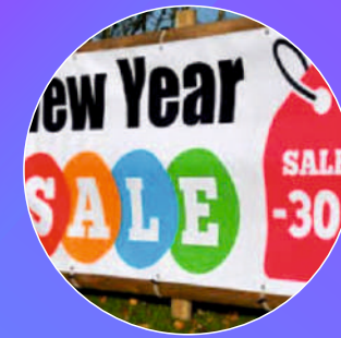
PVC Outdoor Banner