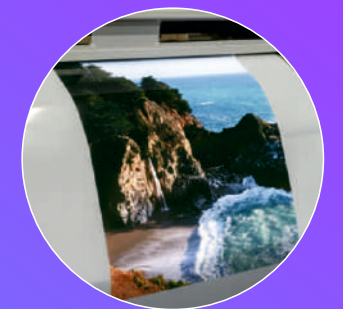
Backlit & Front lit Outdoor Banner