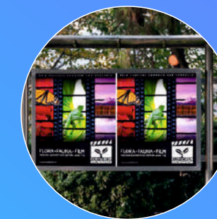
Food & Beverages Banner