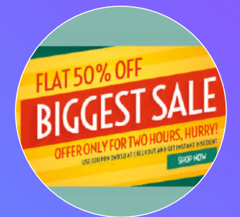
Offer & Discount Banner