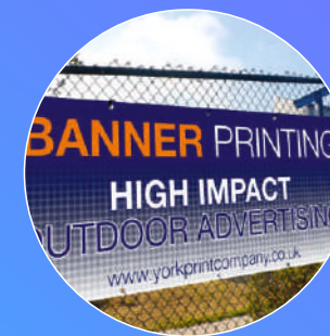
Customized Indoor & Outdoor Banner