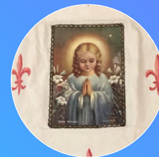
Religious & Spiritual Banner